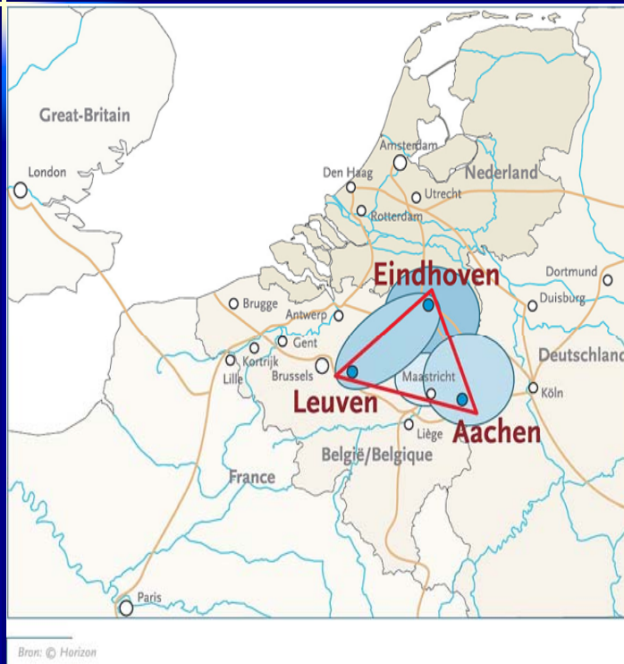
European innovation scoreboard ranking RRSII (revealed regional summary innovation index) (2003)